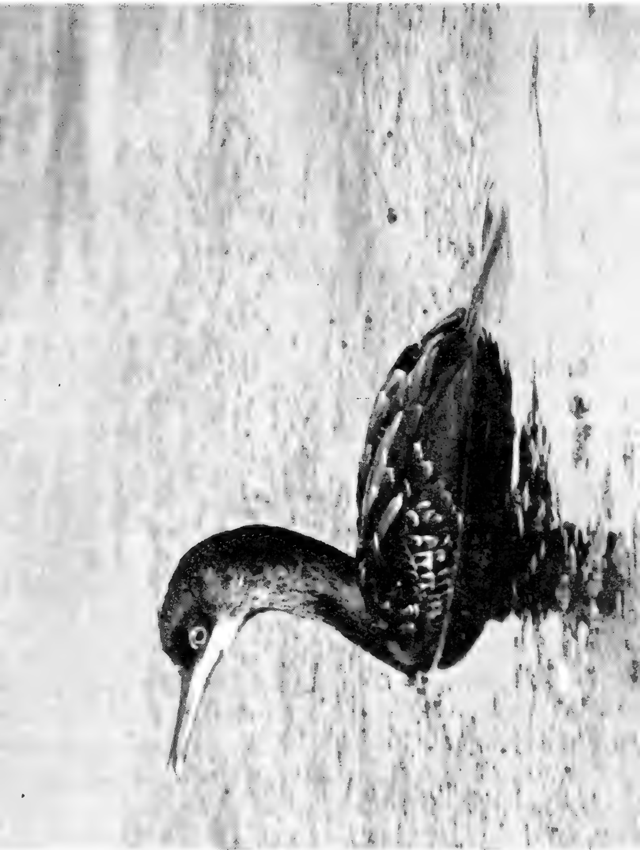
PLATE 1. IMMATURE SHAG